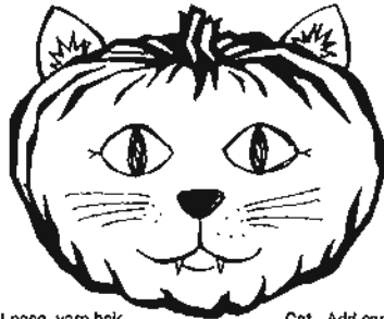
Cat - Add cardboard ears