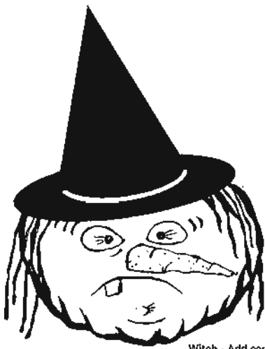
Witch - Add carrot nose, yarn hair and paper hat